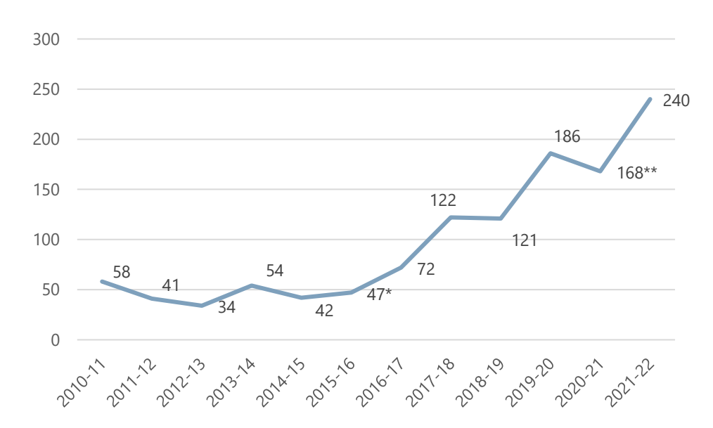
Figure 43 Sentinel event notifications – 1 July 2010 to 30 June 2022<sup>64</sup>

In 2020-21, 25 sentinel events were reported by HSEs and 143 were reported by public hospitals (a total of 168).<sup>62</sup> In 2019-20, 22 sentinel events were reported by HSEs and 164 were reported by public hospitals (a total of 186).<sup>63</sup> The same data is not available for 2021-22.